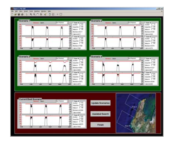
Figure 4. Outcome of the use of the GUI in conjunction with the run of a Genetic Algorithm. In the bottom panel, the best solution the user has found so far is displayed, together with the outcomes of the new runs generated by the GA in the red panel.

At this point the user is free to choose either to proceed via the User Guided Procedure or via the Assisted Search. In either case, the best scenario found so far is included in the process, which means that it also can be modified and ranked.